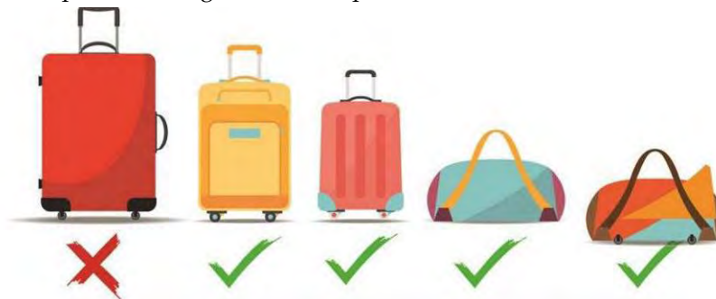
HARD-SIDED BAGS NOT PERMITTED

**Please keep in mind that the baggage compartments on most light aircraft are only 10 inches (25cm) high, so the pilots must have the ability to manipulate the bag into the compartment.